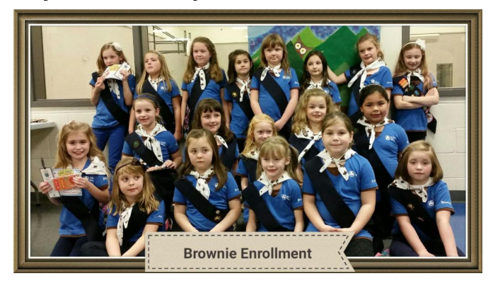
Photo Caption: The 2<sup>nd</sup> St. Thomas Brownies pause for a photo during their recent enrolment ceremony